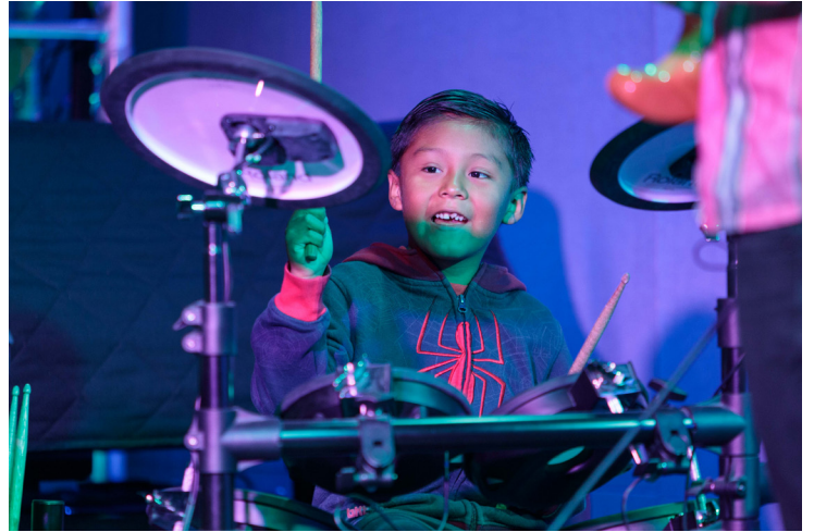
Students at Youth Music Project