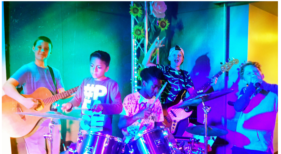
Students at Youth Music Project Rocking Out

Students of electric guitar, bass, drums, piano, and vocals are strongly encouraged to register.