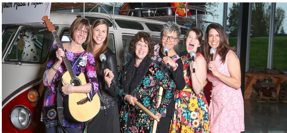
Youth Music Project board members and guests having a rockin' time at the Annual benefit in April