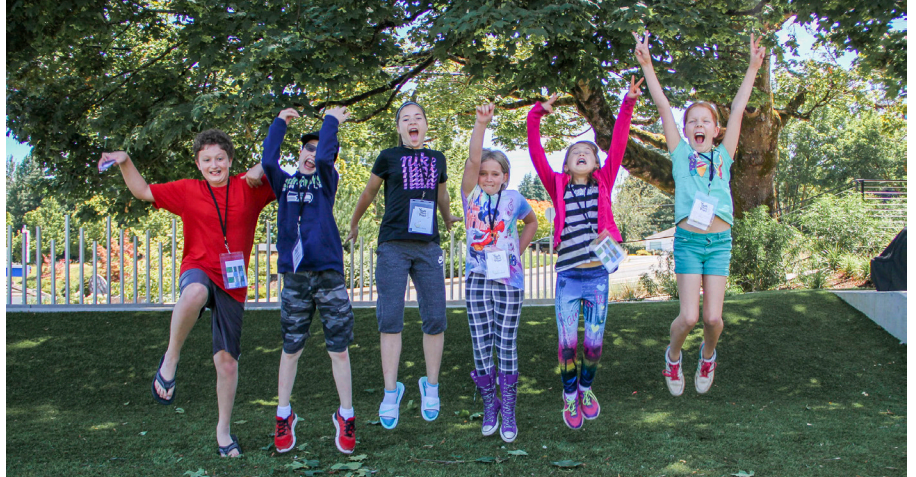
Students at Youth Music Project

During Teen Week, our 13-18 year old students took over. They wrote and performed original songs, formed bands and covered their favorite rock songs, and played in a live show with student sound engineers.