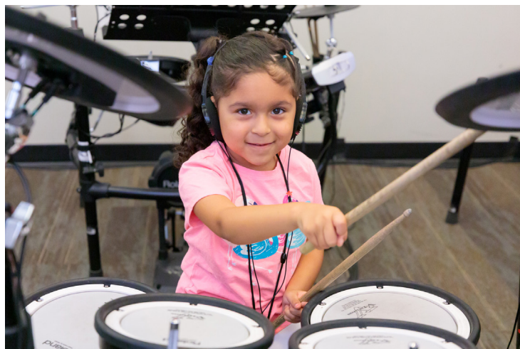
Students at Youth Music Project